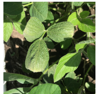
Figure 1. Typical injury symptoms resulting from synthetic auxin OTM; dicamba (left) and 2,4-D (right).