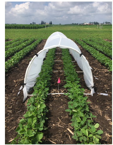
Figure 2. A low-tunnel prior to treatment application and flat placement in 2019 at University of Wisconsin-Madison Arlington Agricultural Research Station, Arlington, WI.